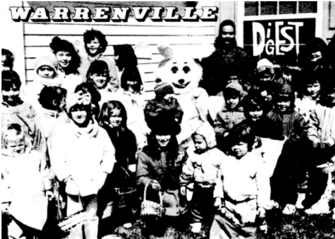
Easter Egg Hunt, April 1990

In the course of the River Oaks Subdivision's short life, there have been a few famous visitors to the neighborhood, but none more famous, perhaps, than the Easter Bunny himself. Mr. Bunny began his visits to the subdivision shortly after the houses were built. Although the visits began as private visits, he was persuaded to make public appearances for the whole community to help with the annual Easter Egg Hunt.